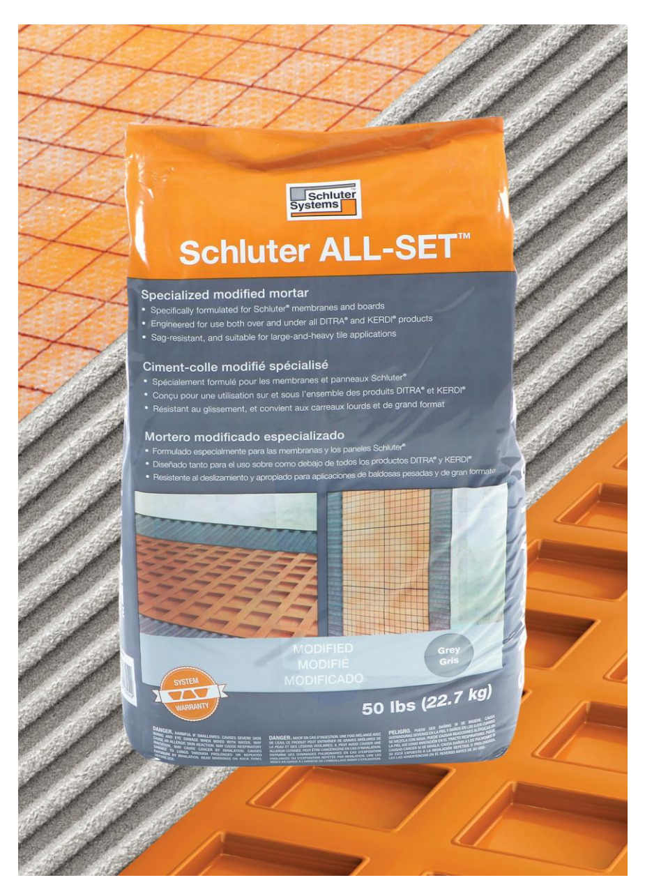
Schluter ALL-SET<sup>™</sup> specialized modified thin-set mortar specifically formulated for use over and under Schluter membranes and boards.

MODIFIED THIN-SET CEMENT MORTAR FOR TILE INSTALLATION MANUFACTURED IN NORTH AMERICA